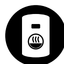
Hot Water Unit